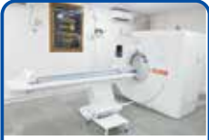
Rotary Rajkot Greater CT Scan Centre at B T Savani Kidney Hospital